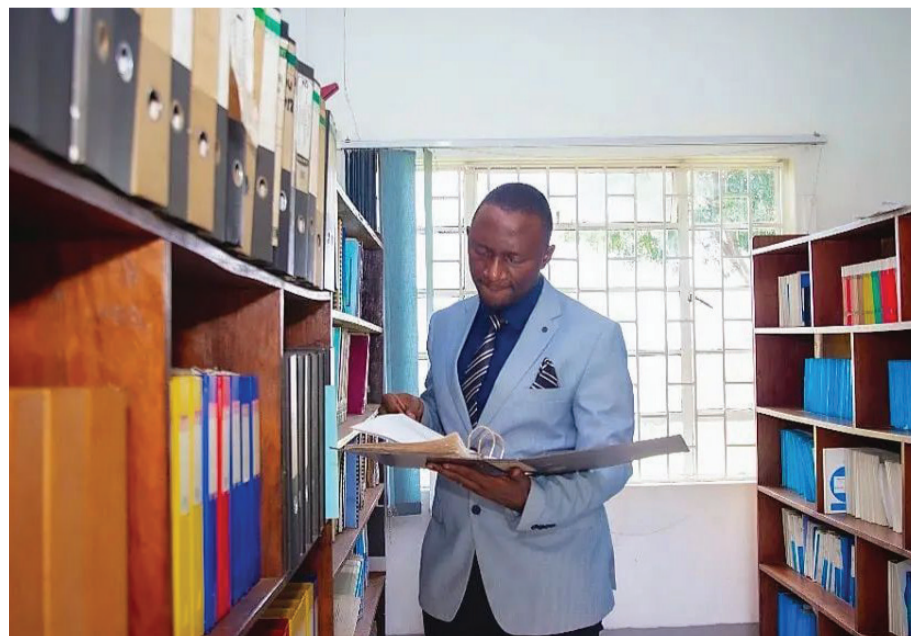
The UNAFRI Library

The significance of good governance was emphasized as a vital tool for guidance and oversight roles in setting the agenda for programme implementation. The need for professionalism was crucial in selection of the Governing Board members. In this regard, due to the performance of the sitting members of the Board. they were re-elected to continue with Board duties.